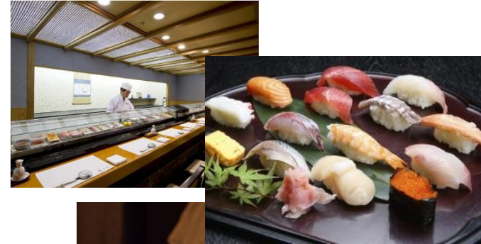
traditional, modern sushi bar